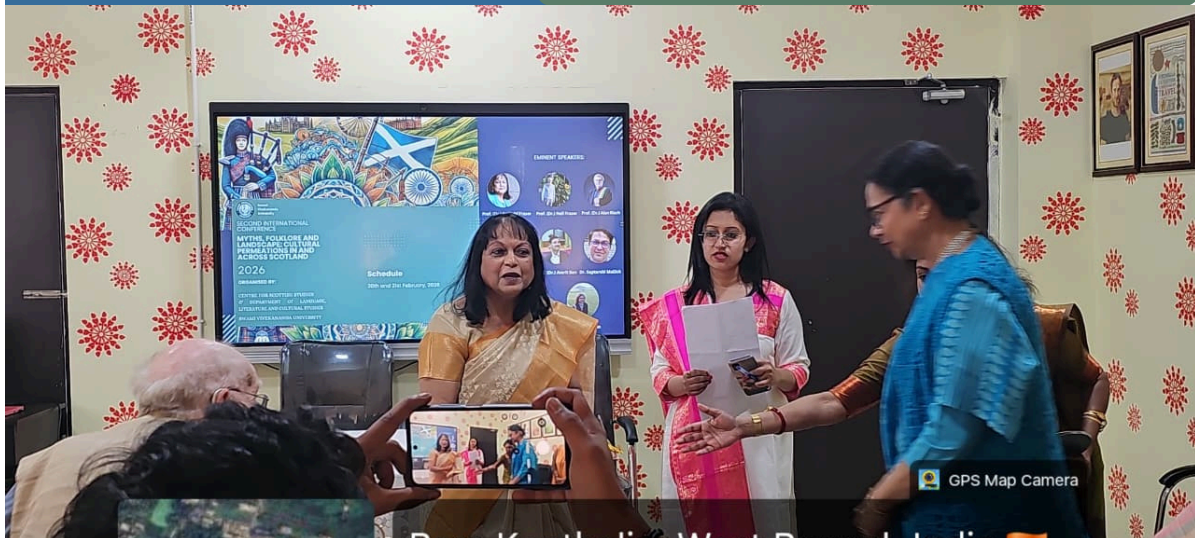
Para Kenthalia, West Bengal, India